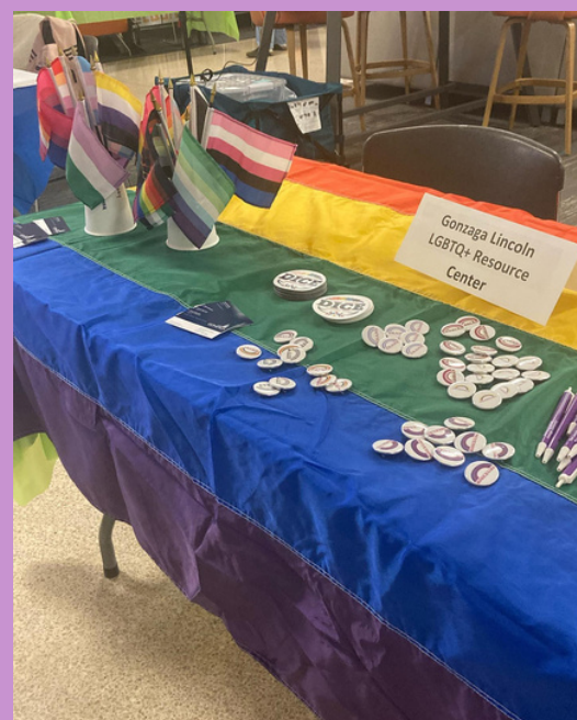
Tabling at Spokane Falls Community College