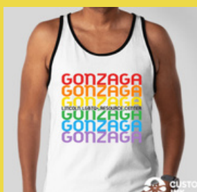
Tank Top: $20