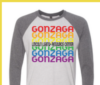
3/4 Sleeve : $25