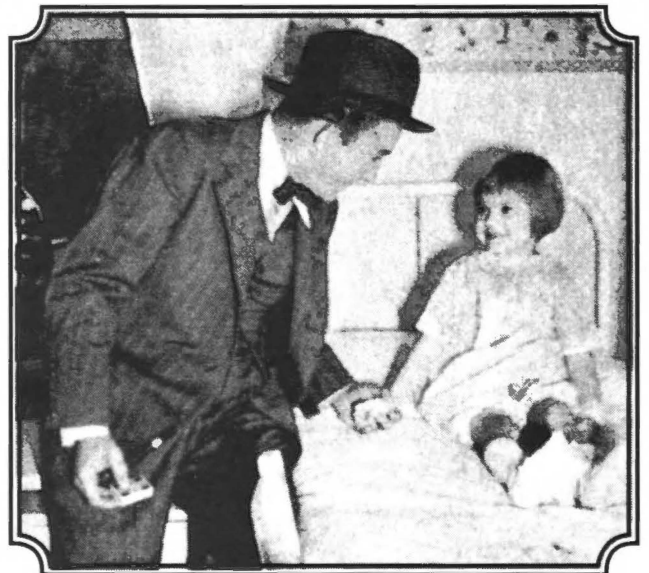
Below: Bing visits with a little girl at the Shriner's Hospital.

of steel, galvanized pressure tank with eight spray showers, painted blue with a large white "G" on each side. The tray on top carried lemons, oranges, towels and water bottles. It rolled on balloon tires.